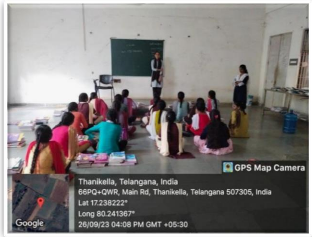
E plus club