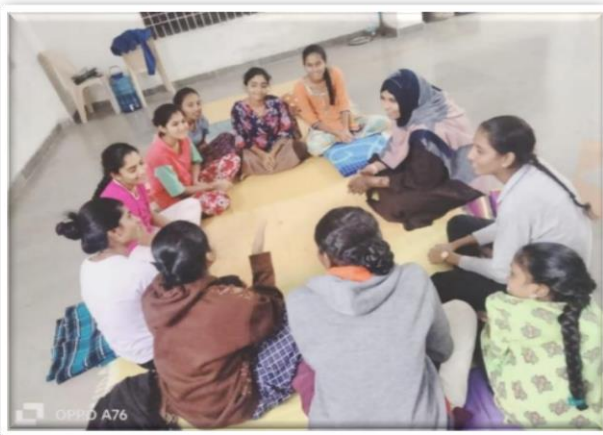
Daily interaction with students