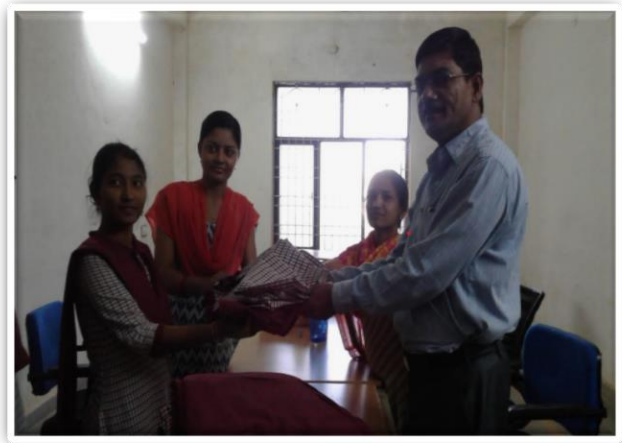
Bedding material distribution