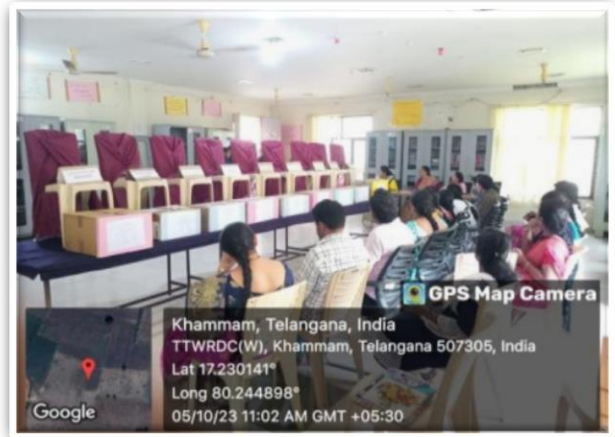
Student Council elections