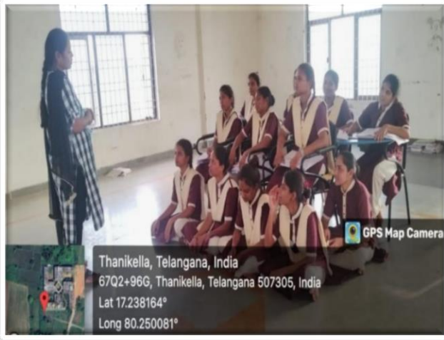
House parent interaction